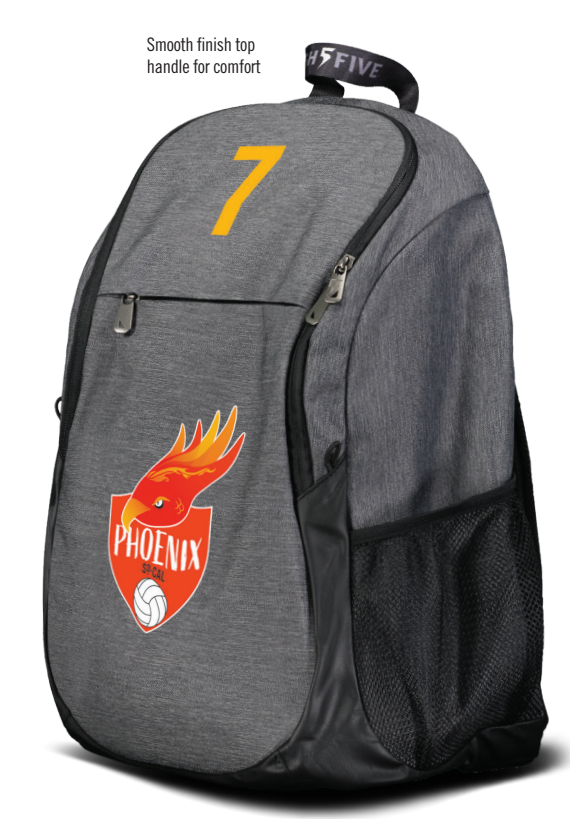
Two side mesh pockets