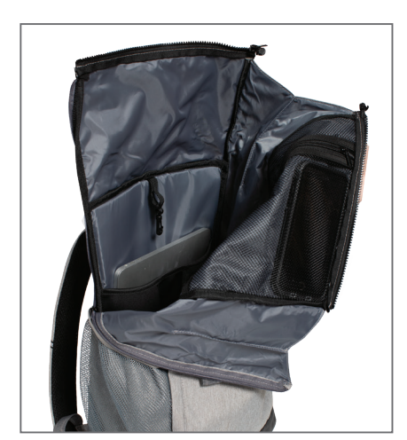
Side zipper access for easy decoration and storage