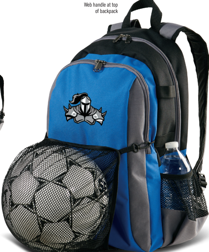
Reinforced, multi-use side pouch pockets with bat straps

Two mesh side pockets for water bottle with pass-thru for lacrosse stick or bat