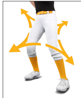
4-Way stretch properties allow for increased mobility