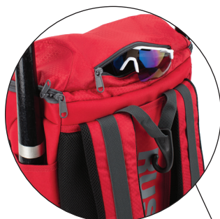
Web handle at top of backpack with fence clip with hidden pocket to store away when not in use