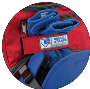
Hook and loop strip closure for batting gloves