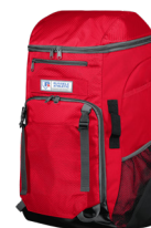
TRUE RED TRR