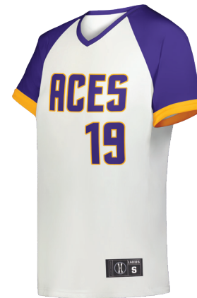
All Over 2.0

Visit augustasportswear.ca/sublimation for full design line offering