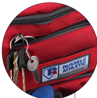
Front zippered pocket for batting gloves etc.