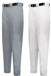
BASEBALL GREY BG7 WHITE WHI