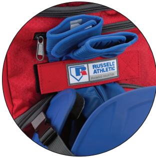
Hook and loop strip closure for batting gloves