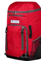
TRUE RED TRR