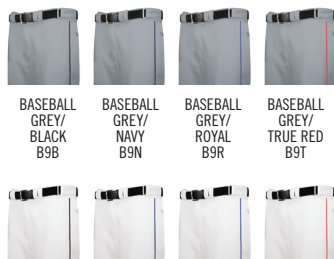
BASEBALL GREY/BLACK B9B BASEBALL GREY/NAVY B9N BASEBALL GREY/ROYAL B9R BASEBALL GREY/TRUE RED B9T WHITE/BLACK WBK WHITE/NAVY WNA WHITE/ROYAL WRO WHITE/TRUE RED WTR