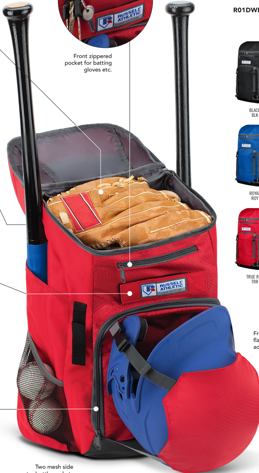
Two mesh side water bottle pockets