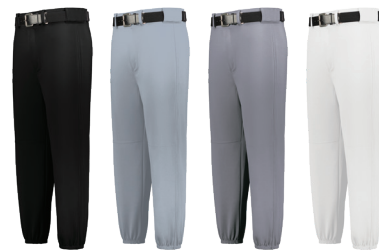
BLACK 080 BLUE GREY 053 GRAPHITE 059 WHITE 005