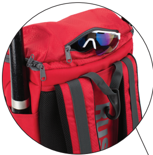
Web handle at top of backpack with fence clip with hidden pocket to store away when not in use