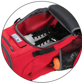
Large dual entry main interior compartment with two zipper pulls