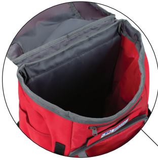
Top zippered opening with collapsible shelf for glove