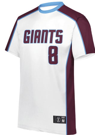
Classic Color Block

Visit augustasportswear.ca/sublimation for full design line offering