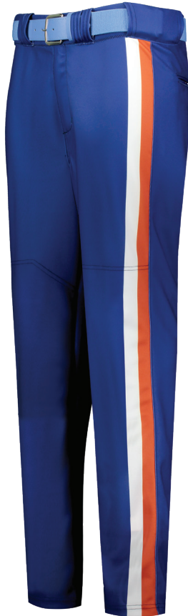
Double Play Stripe