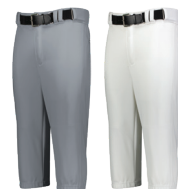
BASEBALL GREY BG7 WHITE WHI