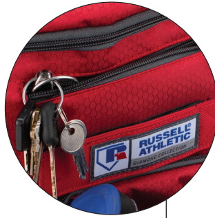
Front zippered pocket for batting gloves etc.