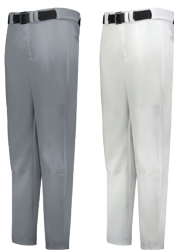
BASEBALL GREY BG7 WHITE WHI