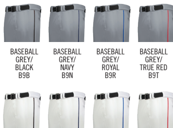
BASEBALL GREY/ BLACK B9B BASEBALL GREY/ NAVY B9N BASEBALL GREY/ ROYAL B9R BASEBALL GREY/ TRUE RED B9T WHITE/ BLACK WBK WHITE/ NAVY WNA WHITE/ ROYAL WRO WHITE/ TRUE RED WTR