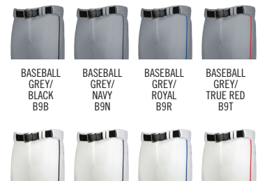
BASEBALL GREY/BLACK B9B BASEBALL GREY/NAVY B9N BASEBALL GREY/ROYAL B9R BASEBALL GREY/TRUE RED B9T WHITE/BLACK WBK WHITE/NAVY WNA WHITE/ROYAL WRO WHITE/TRUE RED WTR