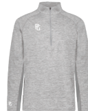
Athletic Grey Heather