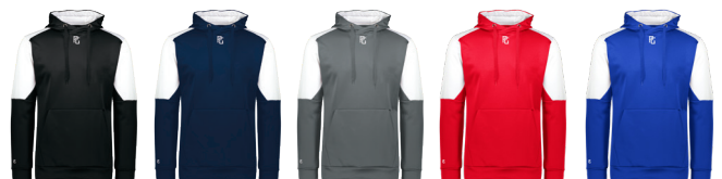
Black/White Navy/White Iron/White Scarlet/White Royal/White

Dry-Excel™ 5.9 ounce 100% polyester performance wicking fleece with color secure® technology that helps prevent dye migration. Wicks moisture. 3 piece hood with lightweight mesh lining.