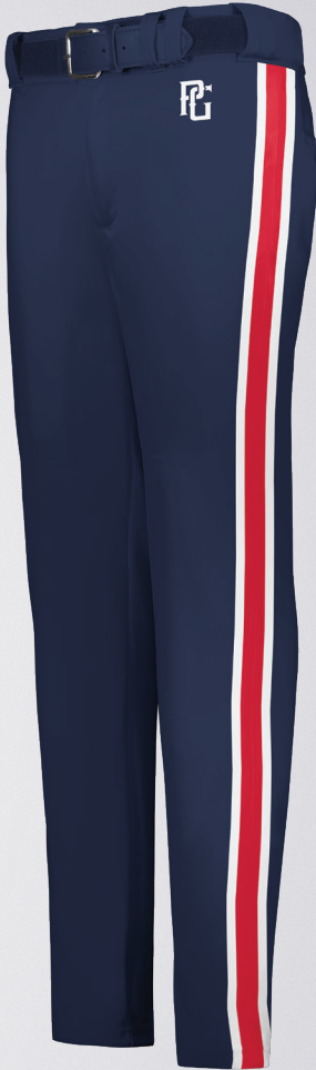
Double Play Stripe Design