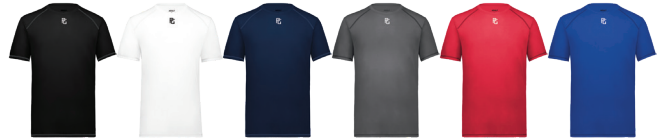
Black White Navy Iron Scarlet Royal

100% soft-spun polyester with color secure® technology that helps prevent dye migration with a soft cottony feel.