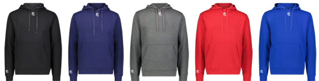
Black Navy Graphite Scarlet Royal

9 ounce 60% cotton/40% polyester athletic fleece. Jersey lined hood with flat braid drawcord.