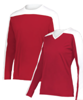
223502 223602 223702 Momentum Team Long Sleeve Tee