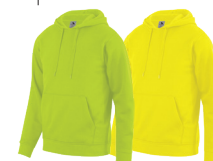
LIME 096 POWER YELLOW 810