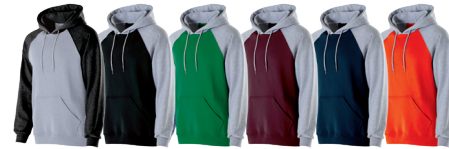
ATHLETIC HEATHER/ BLACK 158