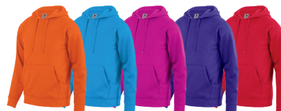
ORANGE 029 POWER BLUE 812 POWER PINK 809 PURPLE 050 RED 040