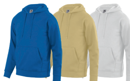
ROYAL 060 VEGAS GOLD 023 WHITE 005