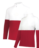
223500 223600 223700 Momentum Team 1/2 Zip Pullover