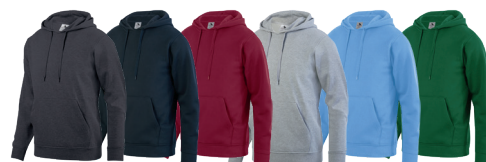
CARBON HEATHER E83 BLACK 080 CARDINAL J36 CHARCOAL HEATHER 017 COLUMBIA BLUE 089 DARK GREEN 035