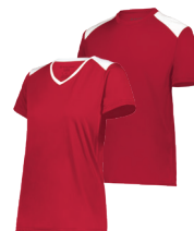
223501 223601 223701 Momentum Team Tee