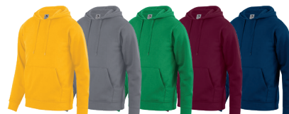
GOLD 025 GRAPHITE 059 KELLY 030 MAROON 045 NAVY 065