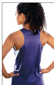
Modified Racerback on Ladies