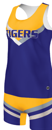
Diagonal Color Block