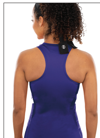
Racerback on Ladies