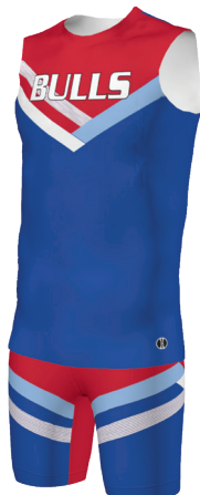
Diagonal Color Block