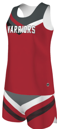
Diagonal Color Block