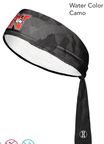
Water Color Camo