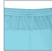
Mesh Back Yoke

AQUA Y07 BLACK 080 CORAL 043 GRAPHITE 059 LIGHT LAVENDER 868 NAVY 065 POWER PINK 809 RED 040 ROYAL 060