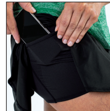
Hidden Side Pocket