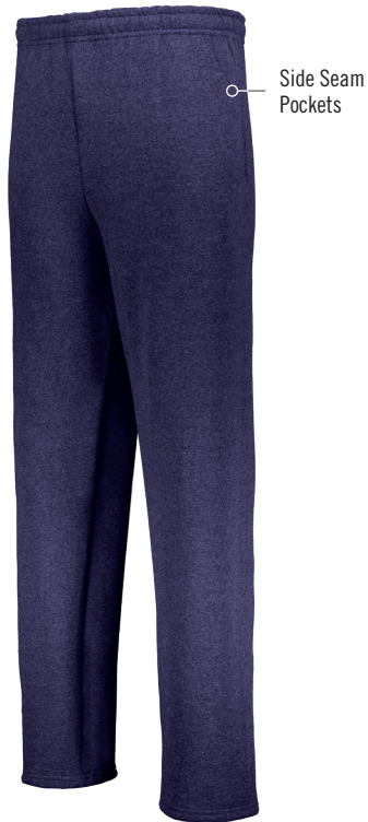
Side Seam Pockets