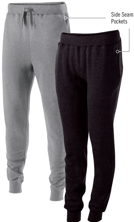
Side Seam Pockets