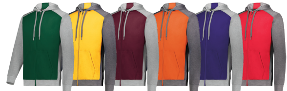
DK GREEN/ GREY HEATHER W25