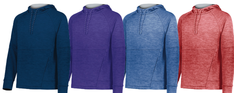
NAVY HEATHER/ SILVER 107