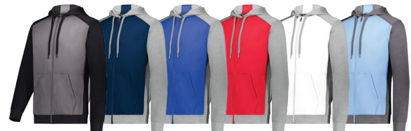
CARBON HEATHER/ BLACK F39