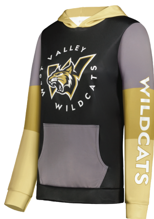
Color Block III