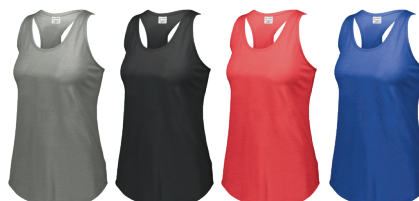
GREY HEATHER 013