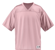
LIGHT PINK 095