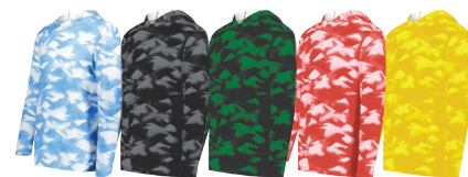
GLACIER COL BLUE 76V GLACIER BLACK 87V GLACIER DK GREEN 88V GLACIER SCARLET 86V GLACIER GOLD 85V