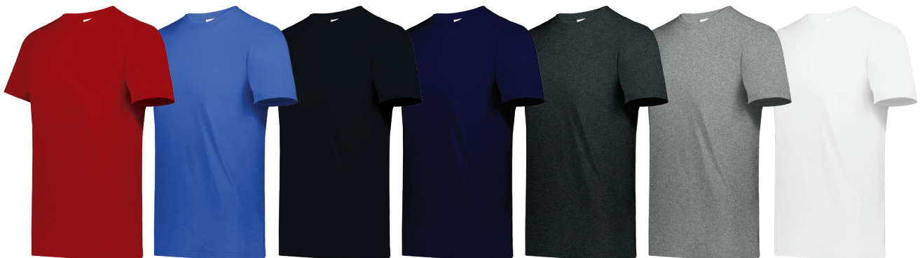
CHERRY RED 085