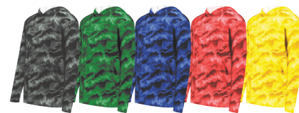
SHOCKWAVE GRAPHITE 86V SHOCKWAVE DK GREEN 87V SHOCKWAVE NAVY 88V SHOCKWAVE SCARLET 70V SHOCKWAVE GOLD 71V