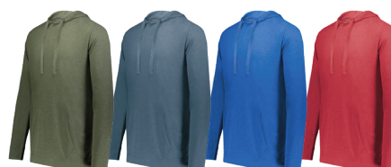
OLIVE HEATHER 49N