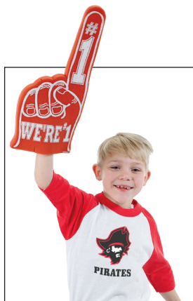
Available in Toddler (422)