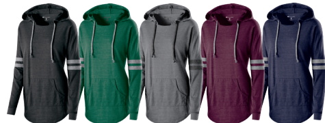
VINTAGE BLACK/ VINTAGE GREY M44