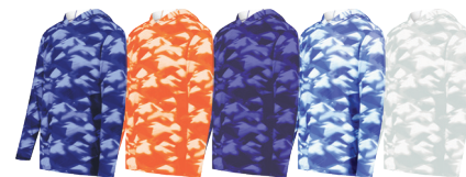
GLACIER NAVY 84V GLACIER ORANGE 83V GLACIER PURPLE 82V GLACIER ROYAL 81V GLACIER SILVER 80V