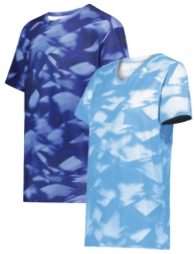
COORDINATING TEES 222596 | 222696 | 222796