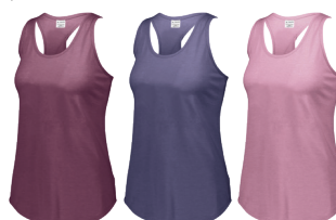
MAROON HEATHER T09