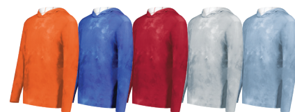
ORANGE CLOUD PRINT 68T ROYAL CLOUD PRINT 63T SCARLET CLOUD PRINT 66T SILVER CLOUD PRINT 69T STORM CLOUD PRINT 70T