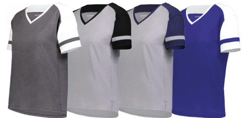
CARBON HEATHER/ WHITE 99E