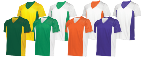
DARK GREEN/ GOLD 442