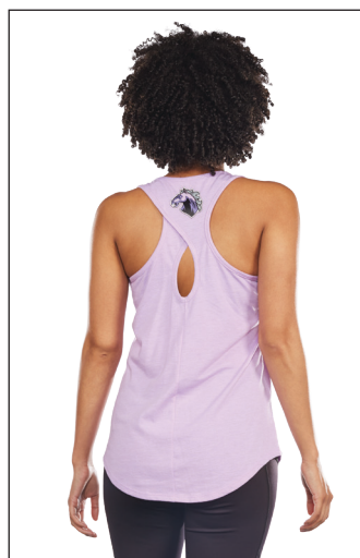
Racerback with keyhole