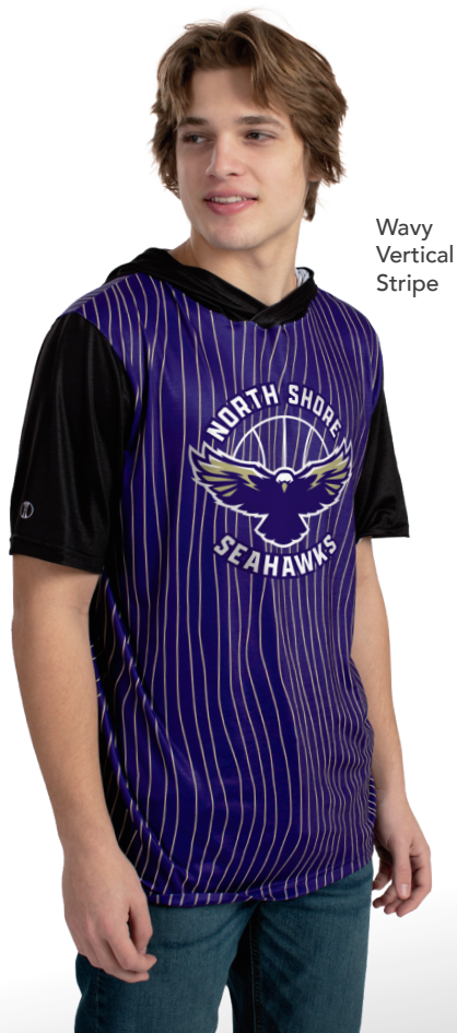
Wavy Vertical Stripe