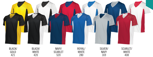
BLACK/ GOLD 421