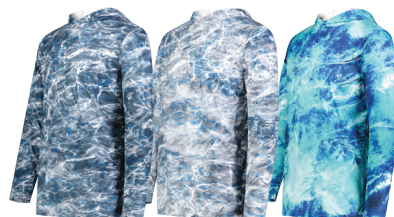
MO ELEMENTS AGUA BLACKFIN 86T