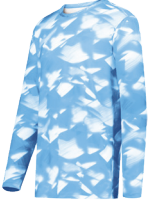
COORDINATING LONG SLEEVE TEE 222597 | 222697