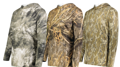
MO ELEMENTS WAKEFORM GALE 88T