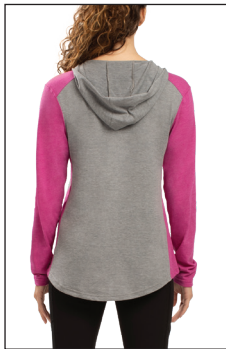
Dropped tail on Ladies