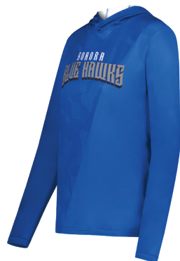
Watercolor Camo II