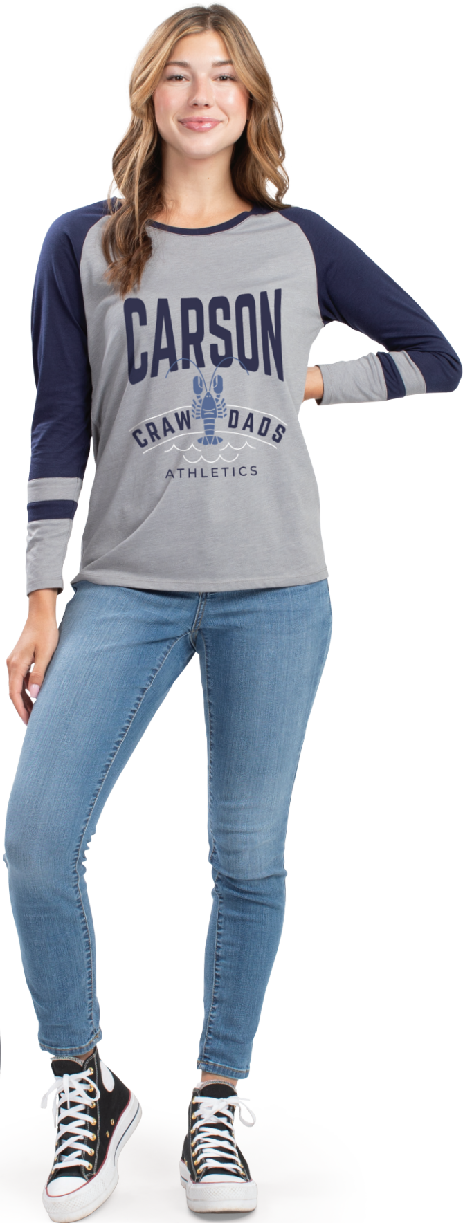
WHITE/ GREY HEATHER 91T