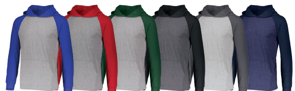
OXFORD/ ROYAL 9UF