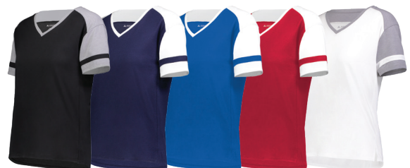
BLACK/ GREY HEATHER 92T