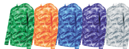
SHOCKWAVE KELLY 72V SHOCKWAVE ORANGE 73V SHOCKWAVE ROYAL 75V SHOCKWAVE PURPLE 74V SHOCKWAVE SILVER 77V

Because of the manufacturing process of the fabric and garment, each tee will be unique